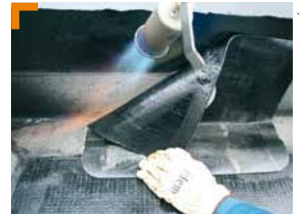
2. Weld the layer onto the first horizontal layer and against the angle already in place.