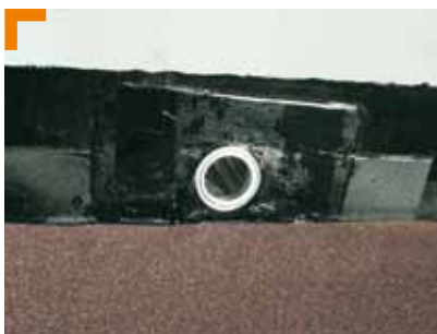
3. Weld the second layer of waterproofing completely.