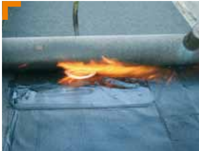
3. Lay and weld the second layer of waterproofing, covering the Depco opening completely.