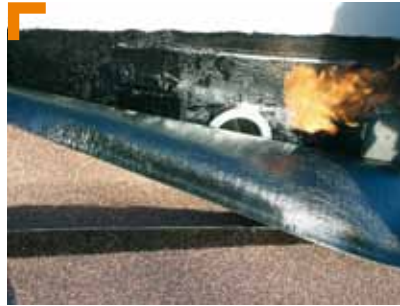
4. Apply the self-protected upstand layer.