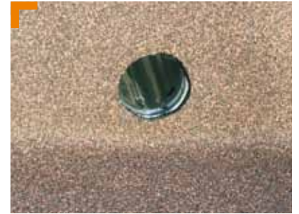
5. Leave to cool for a few minutes, then carefully cut out the hole in the rainwater outlet.