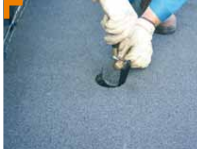
4. Leave the waterproofing membrane to cool for a few moments, then carefully cut out the hole in the rainwater outlet.