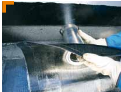
1. Insert Depco into the stack after laying the first layer of waterproofing and the reinforcing angle.

Installation as an overflow on a balcony.