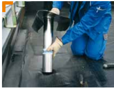
1. Insert Depco into the stack after laying the first layer of waterproofing.

Depco is installed by heat welding with a propane torch.