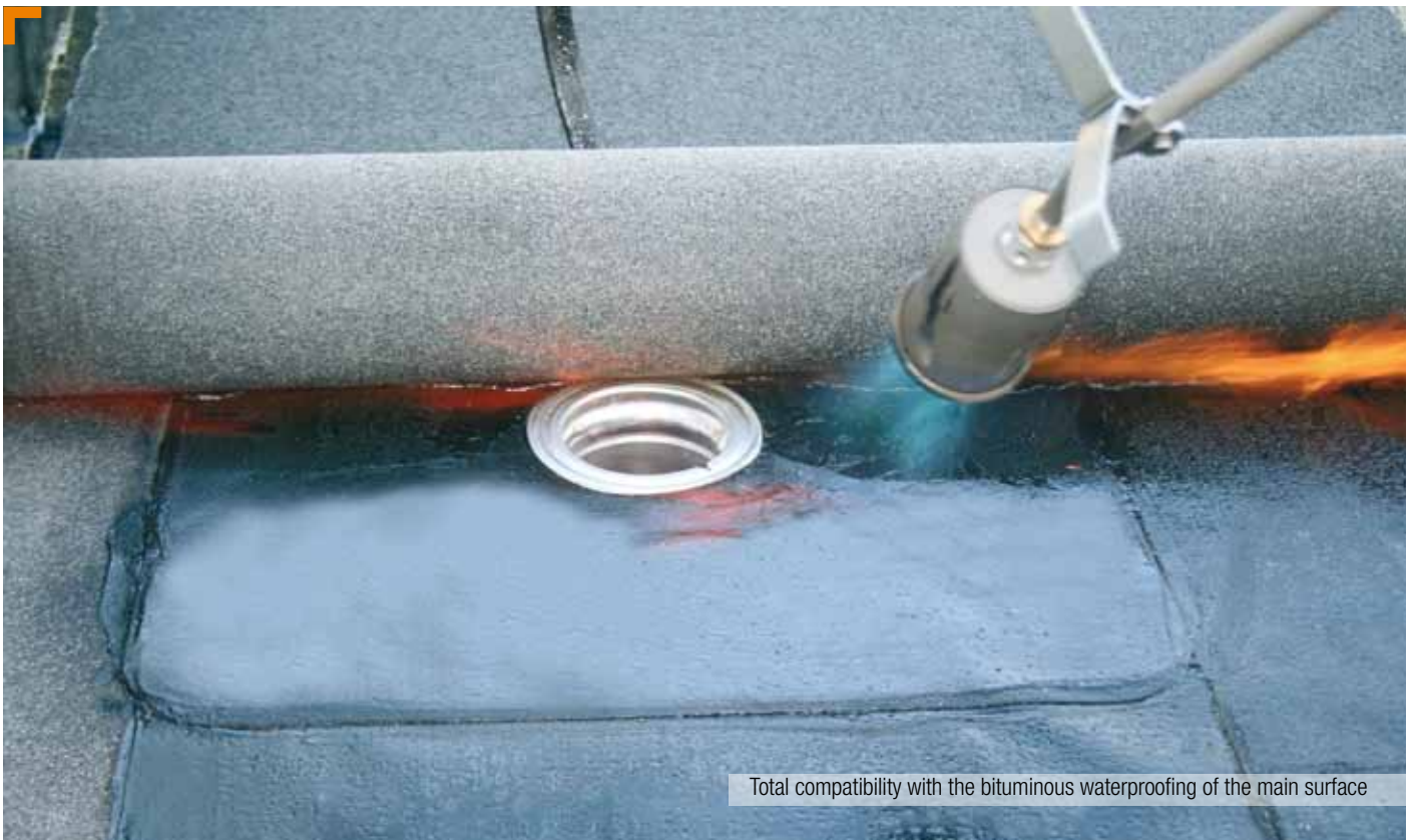
Total compatibility with the bituminous waterproofing of the main surface